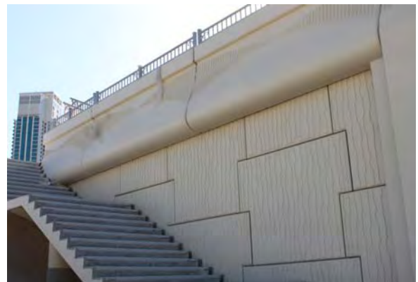
Sectors 2 & 3 Al Reem Island Development Abu Dhabi