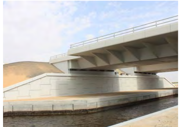
Al Zorah Development Ajman