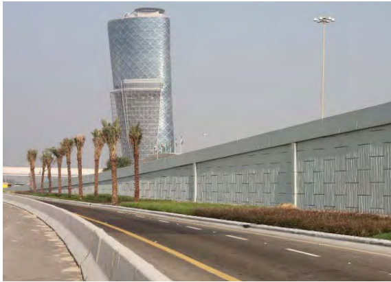
Improvement and Traffic Alleviation on the IP's and Roads around the Abu Dhabi National Exhibition Center (ADNEC)