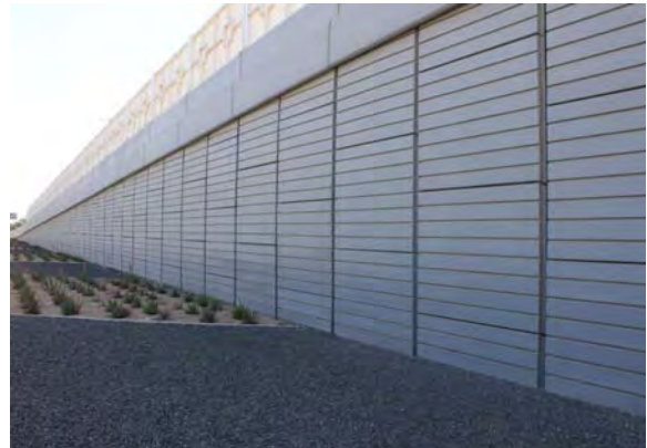
Al Raha IC6 Abu Dhabi, UAE