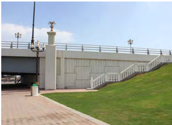
Dibba Al Hisn Road Fujairah