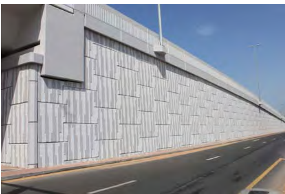
Upgrading & Improvement of Al Qusaidat Ras Al Khaimah, UAE