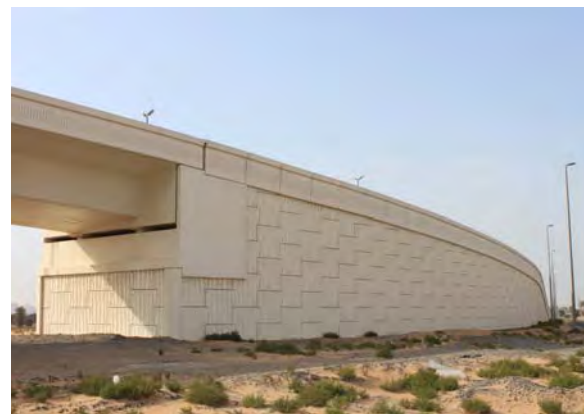
Sheik Ammar Al Nuaimi Bridge Ajman