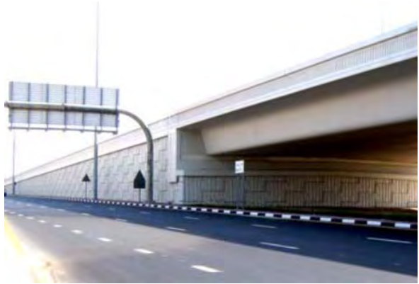
Nadd Al Hamar/Beirut Road Tunnels