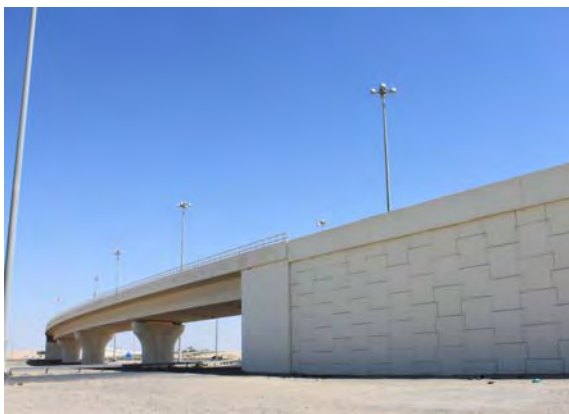
Dualling of Al FayaDhah Road Abu Dhabi