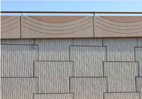
Bridge & Tunnels at IP-44 Abu Dhabi, UAE