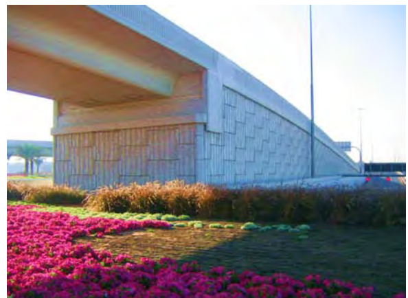
Muscat City Centre Oman