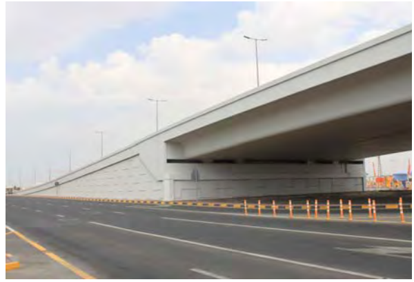
Construction of Two Bridges in Al Etihad Road, Ajman