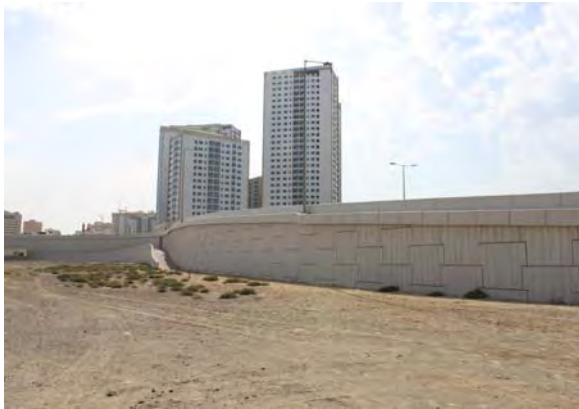
Improvement of Al Hamidiya Ajman