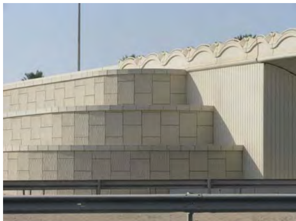
Abu Dhabi – Dubai Road Contract 1B Abu Dhabi