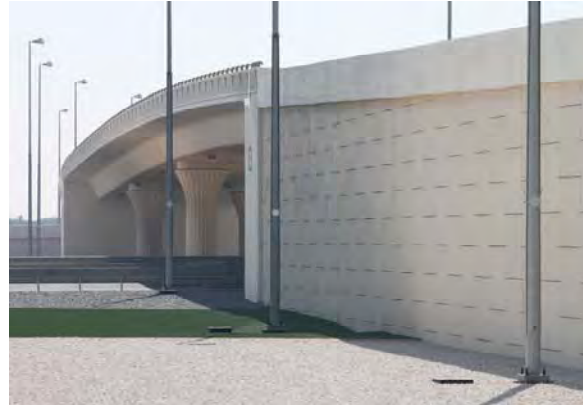
Khalifa Port Interchange Abu Dhabi