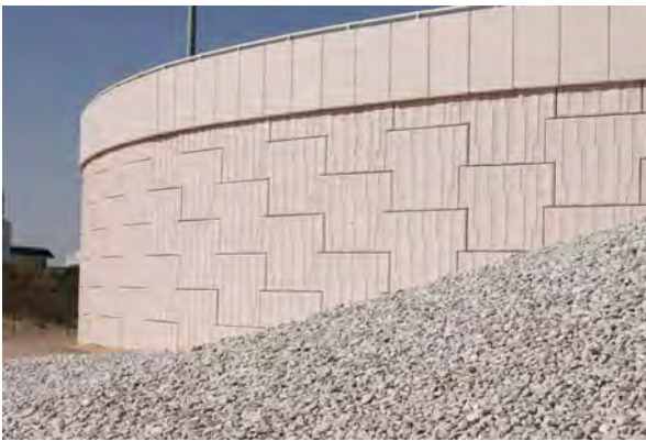
Nahil (E20) Bridge and Underpass Abu Dhabi, UAE